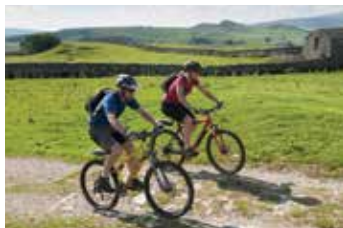
Cycling in the Yorkshire Dales

If you are looking for a weekend break with delicious food and drink, fantastic shopping and great places to explore, then St Andrews, Harrogate, is the place for you.