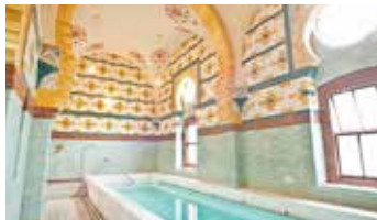
Turkish Baths and Health Spa in Harrogate