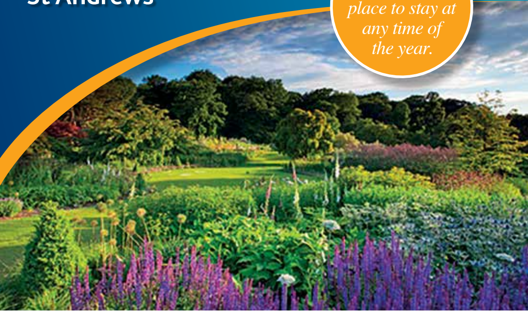
RHS Garden Harlow Carr

Harrogate. The perfect place to stay at any time of the year.