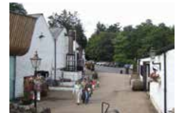
Glenturret whisky distillery